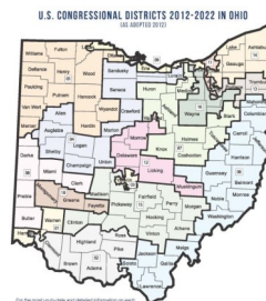
Federal Congressional Districts