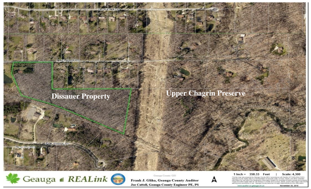
Exhibit 1 - Dissauer Property