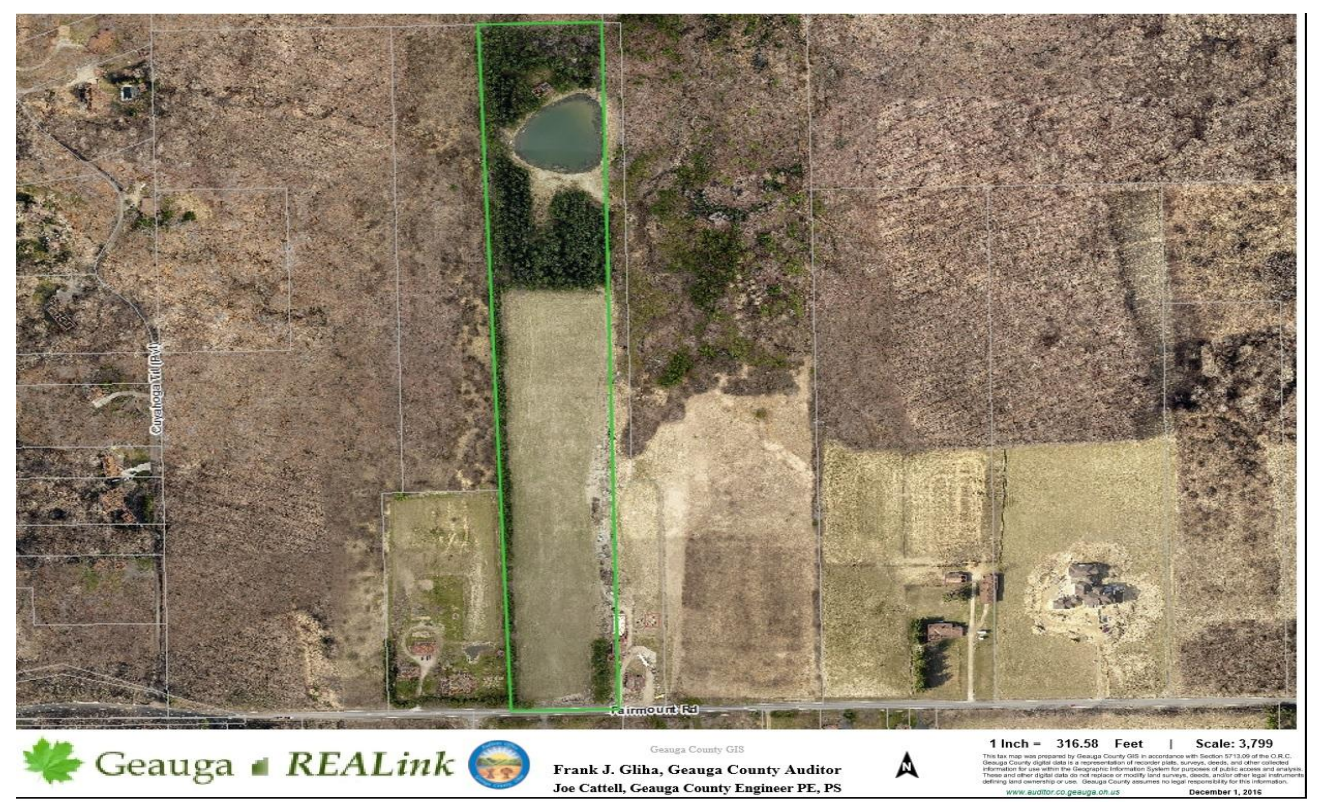
Exhibit 3 - Spisak Property