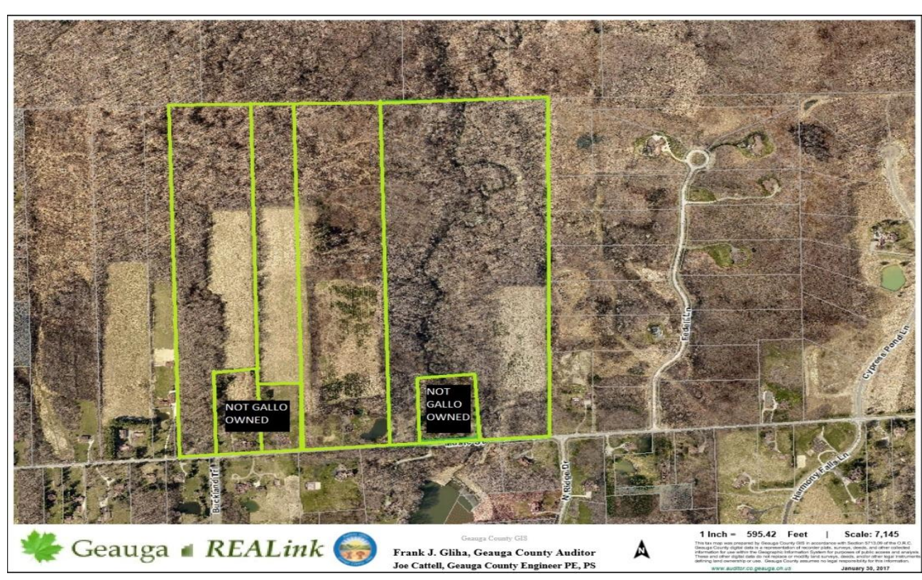
Exhibit 4 - Gallo Properties